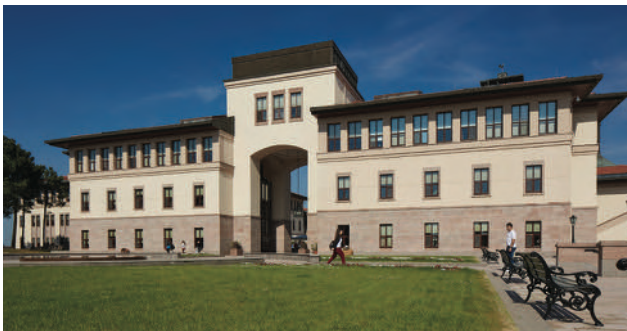
GRADUATE SCHOOL OF HEALTH SCIENCES

West Campus Security Office +90 212 338 70 07 +90 212 338 70